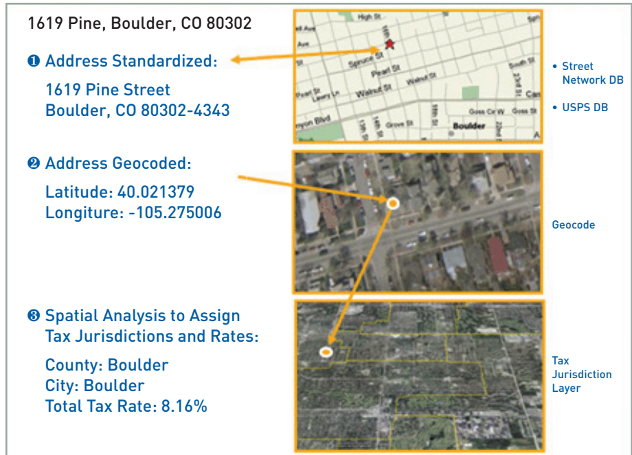
How Enterprise Tax Management works