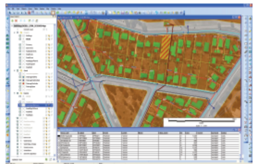
MapInfo Professional v10.0's dockable toolbars provides users a way to organize toolbars, maximizing screen space.